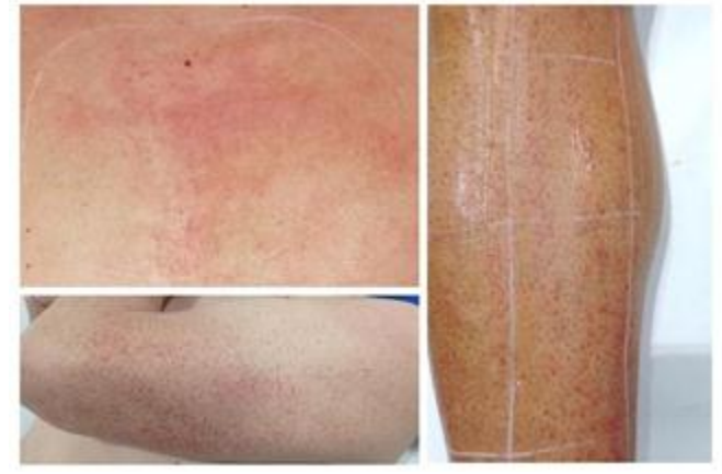
Fig. 5. Skin reactions immediately after finishing the treatment (end point); Treatment ID 1, chest (top left); Treatment ID 2, frontal upper left arm (bottom left); and treatment ID 6, frontal lower right leg (right)

results for Treatment IDs 1, 2 and 6 in static and dynamic modes.