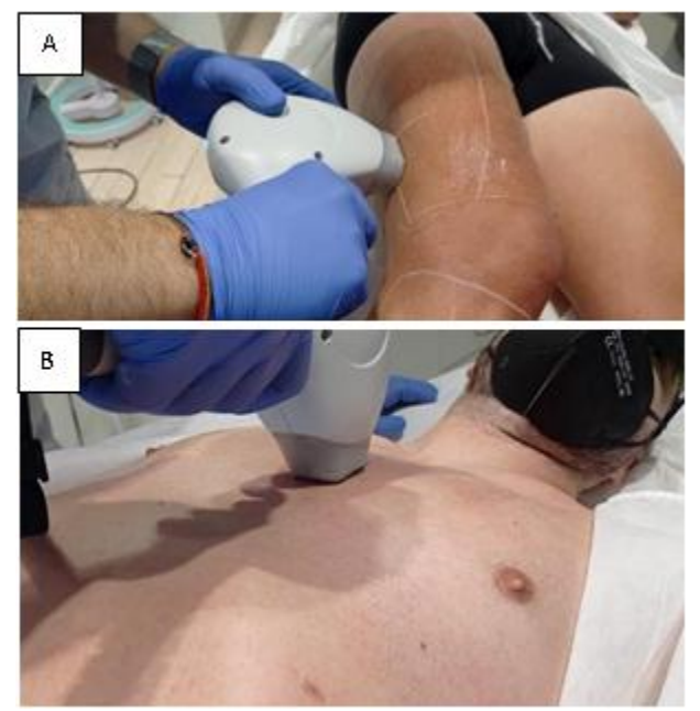
Fig. 2. Applicator performing a treatment. (A) Front upper leg treatment; (B) Chest treatment.

The time spent on each treatment area was also measured and immediate (erythema, edema and post-treatment pain) and posterior (bruising, pigmentation and burns) side effects after the treatment were evaluated. Hair counting was carried out by marking a zone in the treatment area with a 3x4 cm template. Figure 2 shows the applicator performing a treatment.